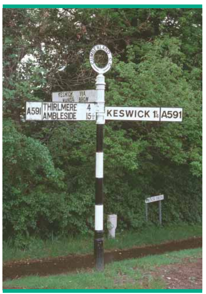
Traditional cast iron fingerposts reinforce local character: Cumbria

Although based on a common model, local authorities had considerable discretion over the design of the posts, arms and finials, and this led to a rich variety of local styles which reinforced local character and