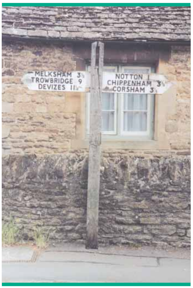
Routine repair and regular maintenance are essential

Fingerpost signs: design prescribed in Traffic Signs Regulations 2002 (Diagram 2141)