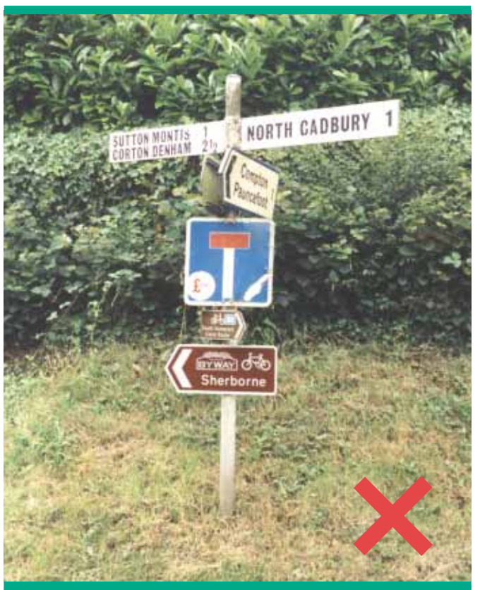
Modern signs and symbols must not be added to fingerposts