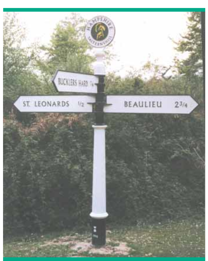
New cast iron fingerpost to traditional design: Salternshill, Hampshire

The original upper case fonts are no longer prescribed and therefore special authorisation is required. Alternatively, Transport Heavy alphabet, as shown on the Newton Longville example (diagram 2141 in the 2002 Regulations) may be used. Chapter 7 of the Traffic Signs Manual includes design guidance. Details of the fonts can be obtained from the Department for Transport. Where new fingerposts are installed, they should replace, not duplicate, existing signs.