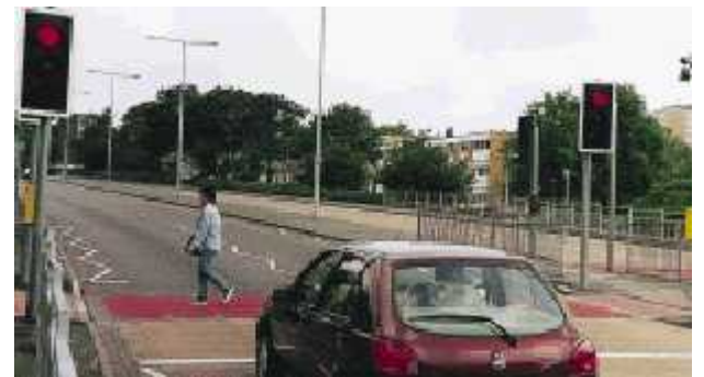
Typical dual Puffin facility

On dual carriageways, Puffins are normally operated as two separate crossings with the usual stagger arrangement. Where the centre refuge is very narrow or where a straight crossing is desirable, the arrangement described in the previous section should be considered. It is recommended that where an additional pushbutton is necessary, for instance because a crossing is particularly wide, careful consideration be given to its position relative to the waiting area. The above-ground kerbside detector zone profile and its suitability for particular site requirements should be taken into consideration. Additional detector(s) may be required to provide a fuller coverage. The highway authority should discuss any special requirements with the equipment supplier.