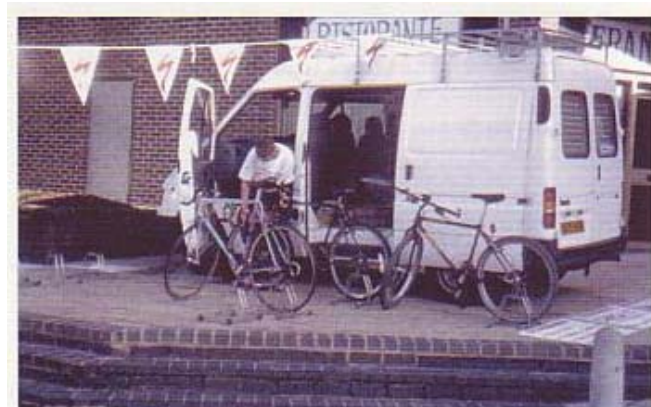
Basingstoke: mobile cycle parking

the mechanical condition of bikes. The van was also used to provide parking at special events. Initial reaction was good, although the number of bikes parked each week subsequently declined. The scheme no longer operates in the shopping centre because the Council has provided covered cycle parking.