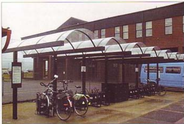
Cycle Station at Salisbury District Hospital

Cycle Centres exist in a number of places around the country. Typically they provide a range of services to cyclists, including secure cycle parking. Such centres have been established in Central London, Liverpool, Leicester and Taunton. Cycle parking is also provided by the Bike 'N' Rack company at Victoria Station, London, with another site planned for Waterloo Station. Some car park operators also offer cycle parking, as do a number of retail cycle shops. Traffic Advisory Leaflet 5/98 gives detailed information on Cycle Centres.