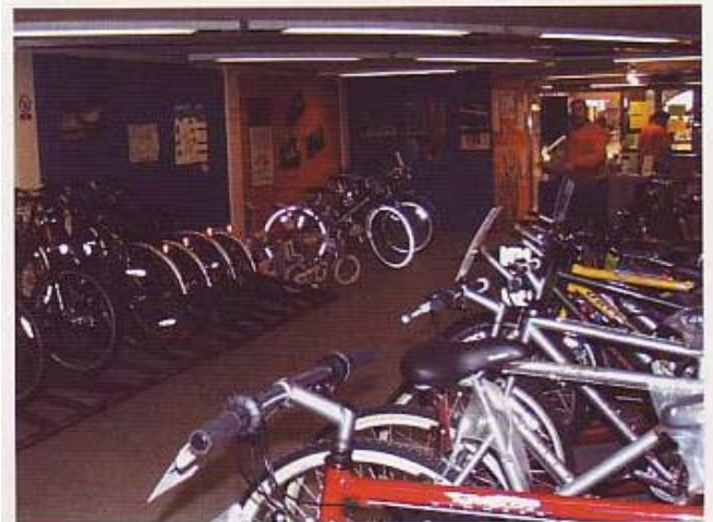
Bike 'N' Rack - Victoria Station

combination lock system might be around £1,500 for 12 bikes. Semi-vertical or vertical stands can be introduced for around £80-£100 for four bikes. Conventional cycle parking and cycle lockers are both capable of being adapted to take payment by coins and by credit or smart cards.