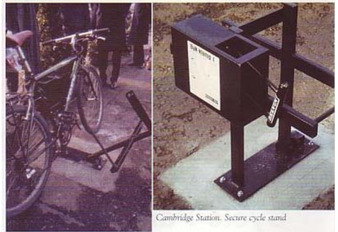
Cambridge Station: Secure cycle stand

Raigmore Hospital NHS Trust , Inverness, has provided a combination of Sheffield stands and cycle lockers for use by staff, visitors and patients. 40 Sheffield stands and 6 cycle lockers, all covered by CCTV, were installed near to the hospital entrance. The Trust has also provided designated on-site shower facilities. The cycle lockers are leased on a rotating yearly basis upon application, and keys are provided for a deposit of £15. The locker scheme was over-subscribed and indications are that the Sheffield stands are also being well used. The scheme will be monitored to assess the effects of encouraging cycling to and from the hospital.